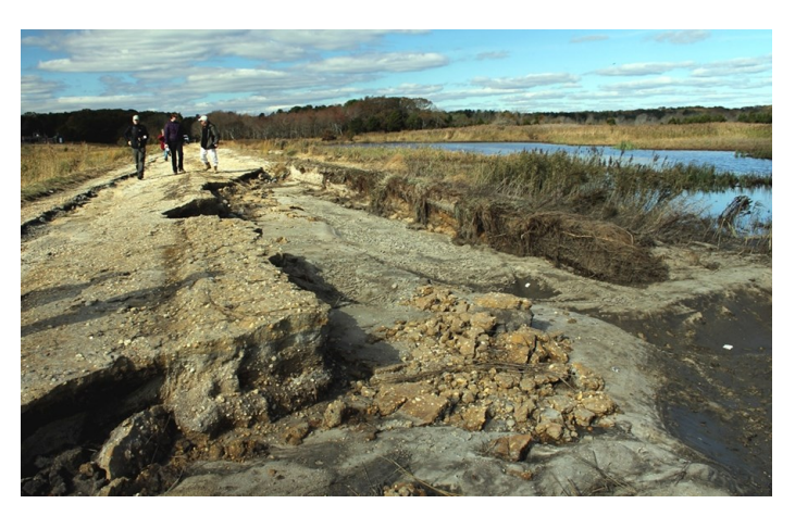
Also inside: Help the Edwin B. Forsythe NWR recover from Hurricane Sandy through the