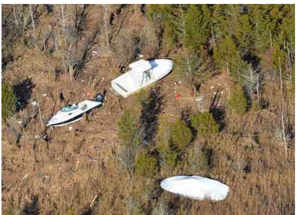
Some of the boats stranded on the shores of Forsythe NWR may be impossible to remove.

But this past October, Hurricane Sandy left behind a 22-mile debris field in the marshes and wetlands along Forsythe's coastal boundary. The freshwater impoundments were over-topped by the storm surge and are now contaminated by salt water. Wildlife Drive was severely damaged. Salvage operations by the U.S. Fish and Wildlife Service are attempting to recover the 176 boats, which potentially carried 6,500 gallons of fuel and other hazardous materials, that were stranded on Forsythe NWR.