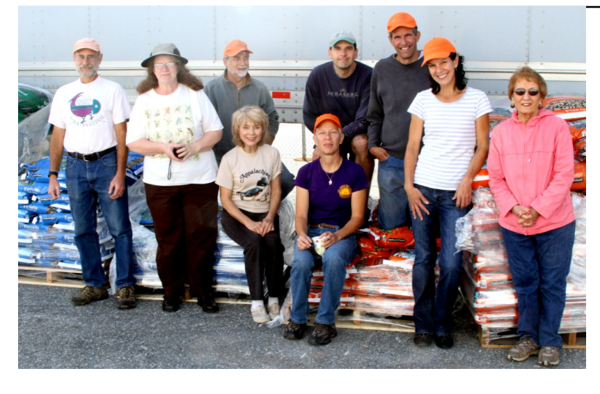
Left: Some of our volunteers take a break for the paparazzi.