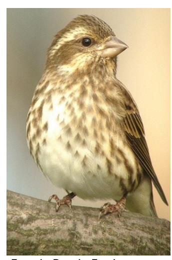
Female Purple Finch

Black-capped Chickadees and Blue Jays are also occasionally found moving south in large numbers in pursuit of better food resources. Raptors too, can travel south in