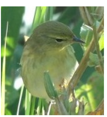
A confusing fall warbler. Can you guess what it is?

Taking technology a step farther is PABirders http://www.facebook.com/? Facebook ref=tn tnmn#!/groups/PABirders/. It's like the listserve, but with the benefits of photos and Facebook interaction with fellow PA birders. Its spin-off, "ID That PA Bird!", http:// www.facebook.com/?ref=tn_tnmn#!/groups/ pabirdID/ helps less experienced birders with identification. I enjoy trying to identify the photos, and I've learned so much from the experienced birders, who give hints like "it can't be an Empidonax flycatcher because it doesn't have wing bars," or, "Blackpoll Warblers tend to be pudgy"! The site features challenging photo quizzes, and the occasional identification debates among the experts