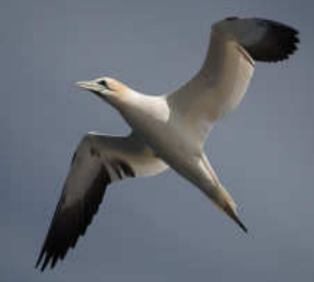
Northern Gannetts flying close overhead were a trip favorite!