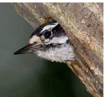
Downy woodpecker peering out

If you would like to bring life to your yard with native habitat, come to Appalachian Audubon's Annual Native Plant Sale at the Meadowood Nursery in Hummelstown on April 28. You don't have to tear out all your non-natives. My plan is to slowly but from its nest cavity. surely reduce the lawn and