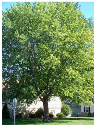
One or more "anchor" trees in your yard can be the foundation of a diverse and marvelous native habitat in your neighborhood.

yard can provide native food to this pretty gray bird